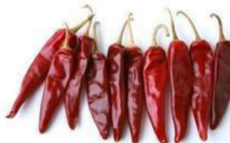
Different types of dry red chillies