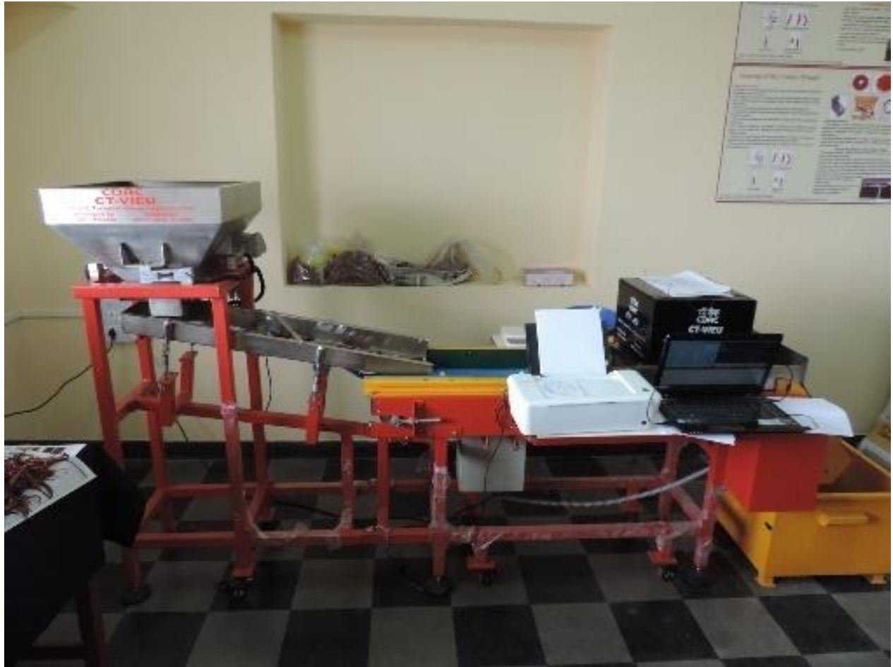
Fig. CT-VIEU System.