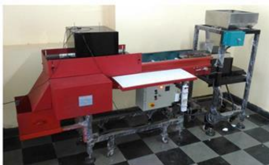
Conveyorized Chilli Quality Assaying Machine

An AI and Image Processing based Quality Assaying Solution for Appearance based Quality Attributes