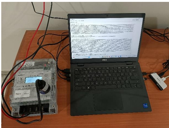
Fig 1: Test Setup of SMITHA-BSMPA